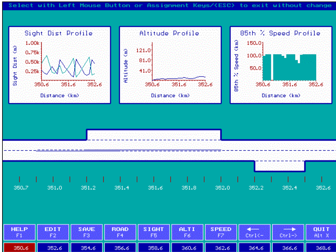
Figure 1 Screenshot from TRARR 4 Road Editor

TRARR is a micro-simulation model; i.e. it models each vehicle individually. Each vehicle is randomly generated, placed at one end of the road and monitored as it travels to the other end. Various driver behaviour and vehicle performance factors determine how the vehicle reacts to changes in alignment and other traffic. TRARR uses traffic flow, vehicle performance, and highway alignment data to establish, in detail, the speeds of vehicles along rural roads. This determines the driver demand for passing and whether or not passing manoeuvres may be executed.